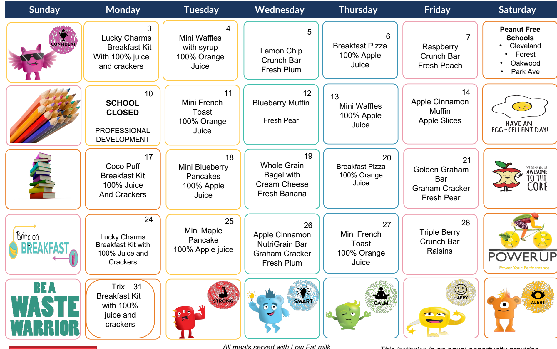
October 2022 Orange Elementary Breakfast

This institution is an equal opportunity provider. Due to Supplier shortages Menu Subject To Change Without Notice